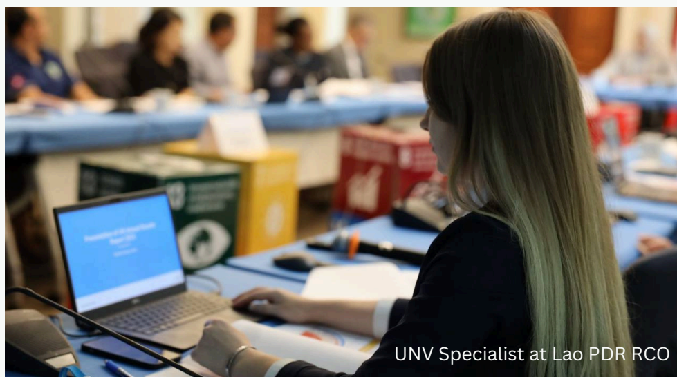
UNV Specialist at Lao PDR RCO